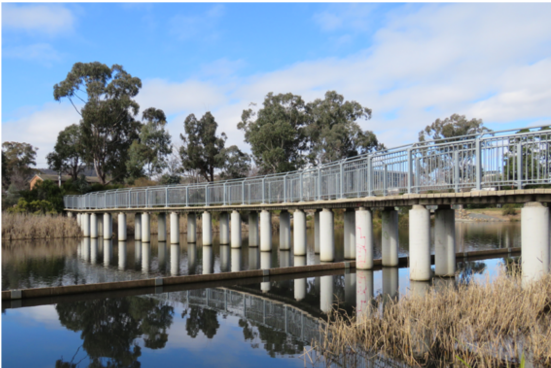
Bridge at Lyneham Wetland.