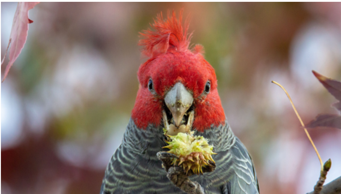
Gang Gang Cockatoo.

Responses provided by directorates have been minimally edited.