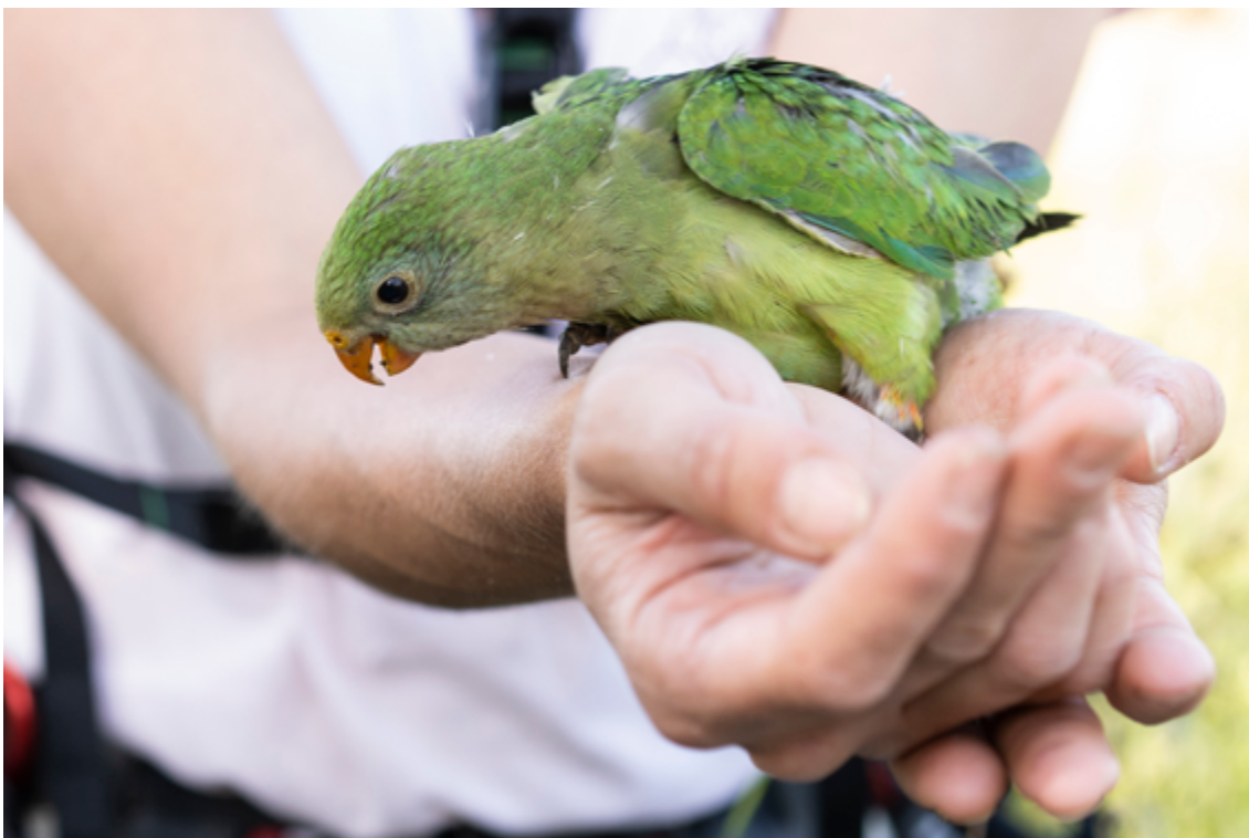
Superb Parrot.