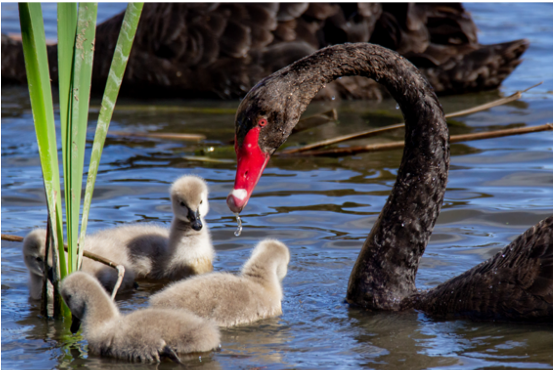
Black swan family.

The Office had no ARIns arrangements during the 2022–23 reporting year.