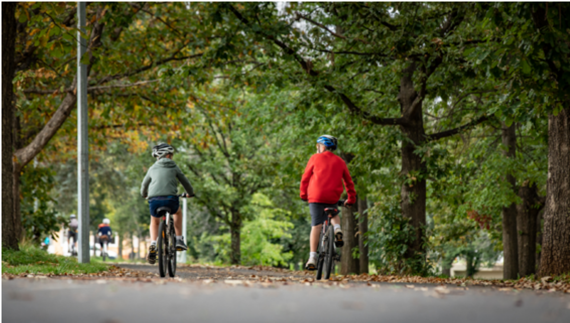
Young people riding bikes in Lyneham.

Health: Insufficient Information – Open: Please define actions taken to work closely with other directorates to progress this recommendation.