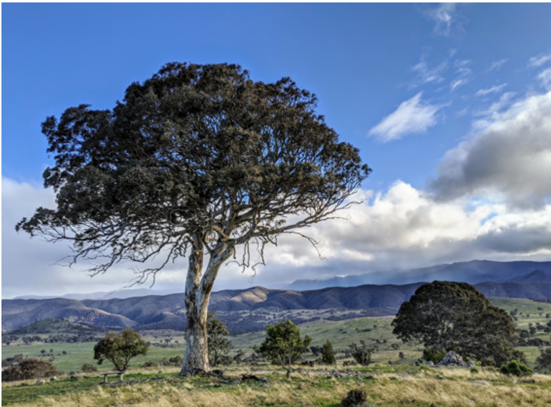
Old growth eucalypt.