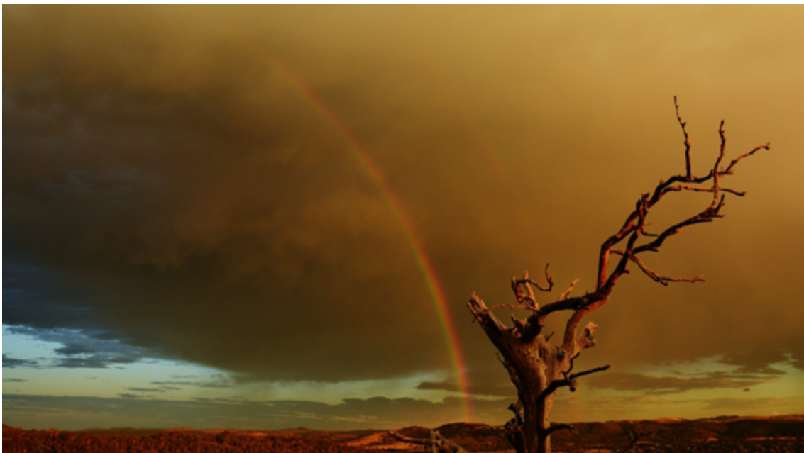
Rainbow over stormy sky.