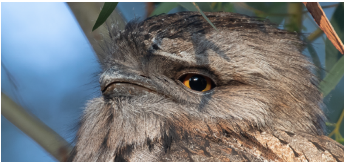
Tawny Frogmouth.