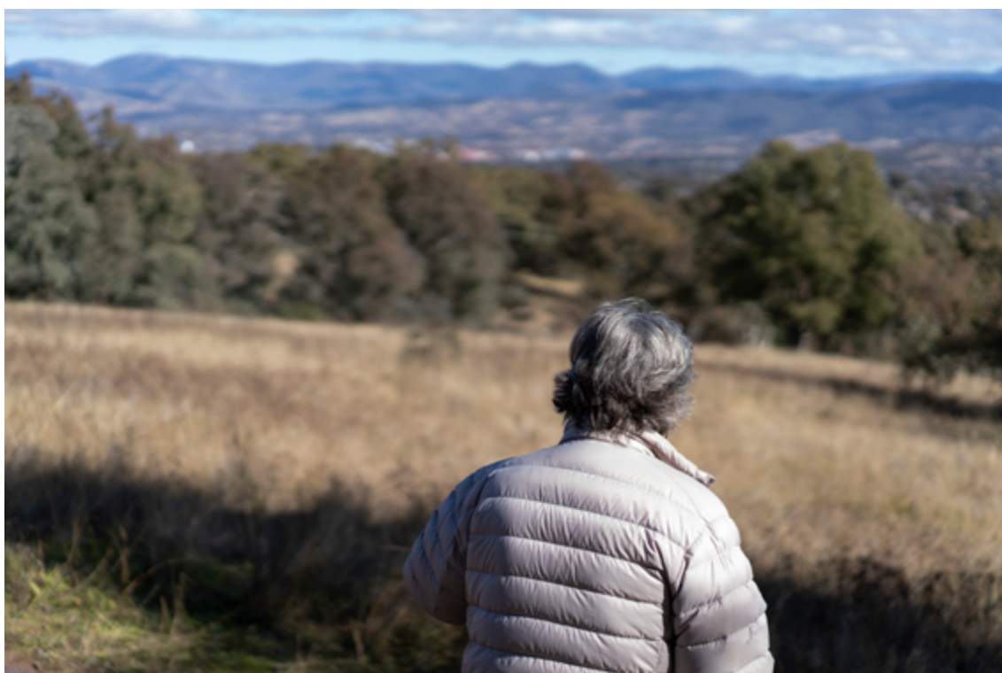
Environmental volunteer overlooking Farrer Ridge.

EPSDD manages the corporate functions of OCSE and reporting under this section is covered in the EPSDD 2022–23 Annual Report as relevant.