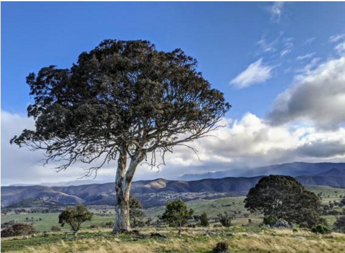
Old growth eucalypt. Credit: Helen Cross