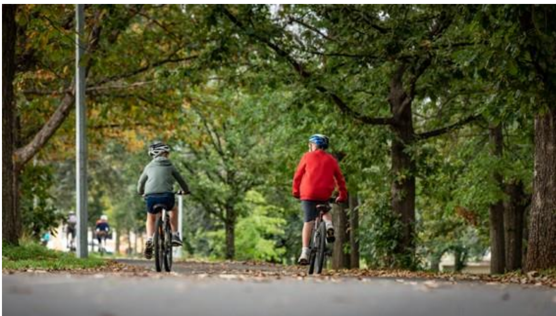
Young people riding bikes in Lyneham.

Health: Insufficient Information — Open: Please define actions taken to work closely with other directorates to progress this recommendation.