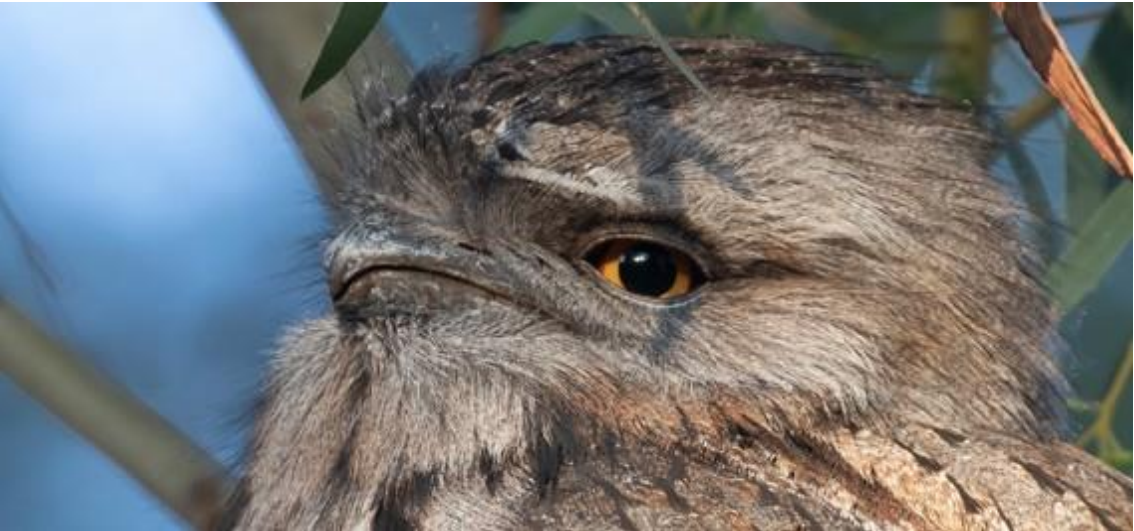
Tawny Frogmouth.