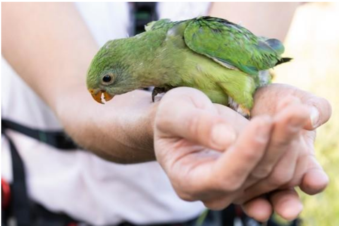
Superb Parrot.