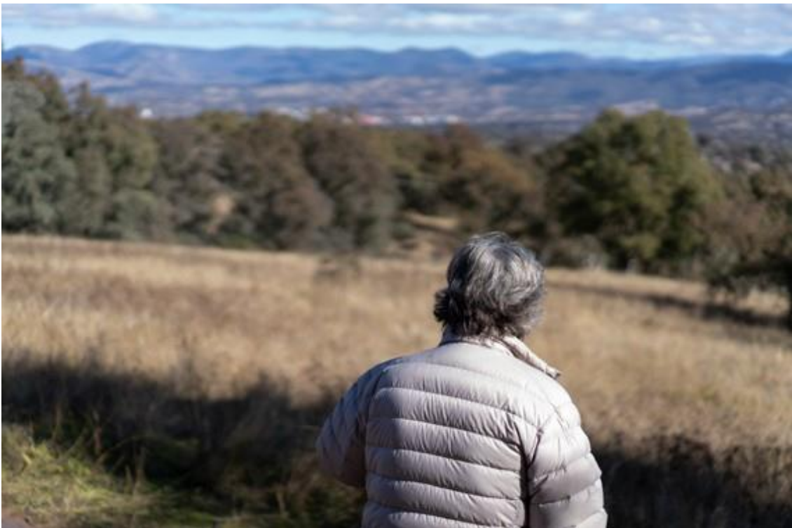
Environmental volunteer overlooking Farrer Ridge.

EPSDD manages the corporate functions of OCSE and reporting under this section is covered in the EPSDD 2022–23 Annual Report as relevant.