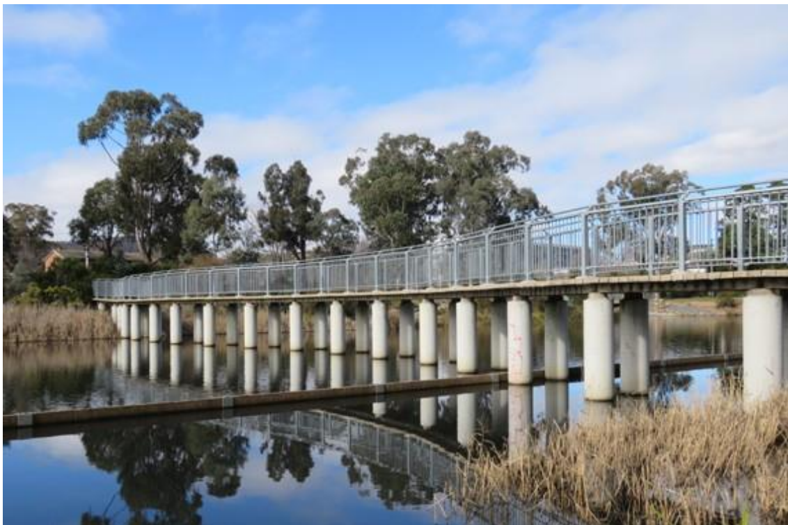
Bridge at Lyneham Wetland. Credit: OCSE