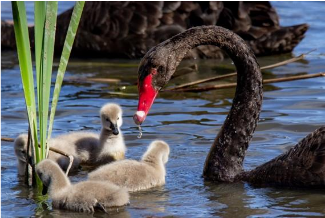
Black swan family.

The Office had no ARins arrangements during the 2022–23 reporting year.