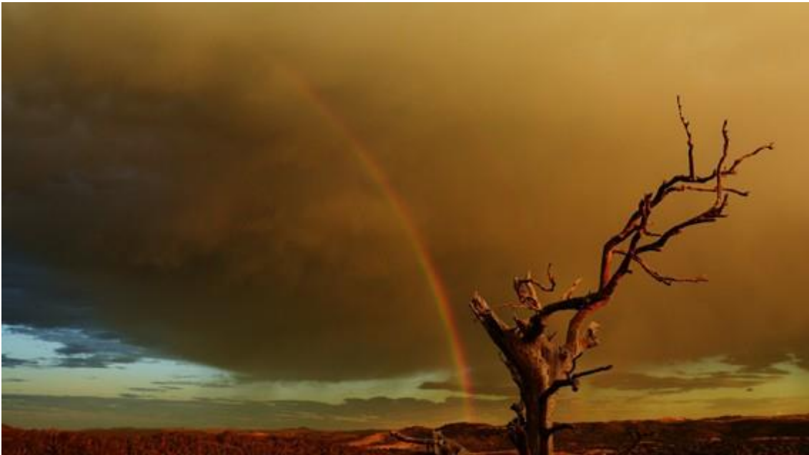
Rainbow over stormy sky.