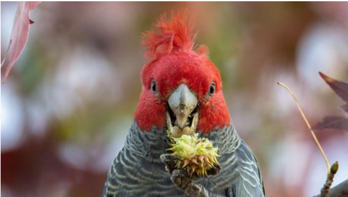
Gang Gang Cockatoo.

Responses provided by directorates have been minimally edited.